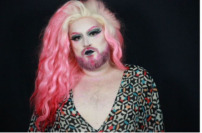
Above left: Noa Fodrie (Boulder, Colorado), Transitionary Period (detail), 2018, acrylic on canvas. 30" x 40". Above right: Louis Trujillo (Aurora, Colorado), Art is a Drag (detail), 2023, digital c-print. Images courtesy of the artists.