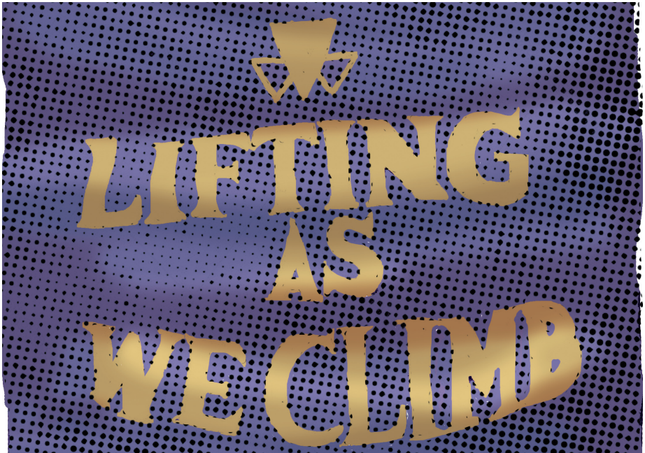
Above: Candice Davis, Lifting As We Climb (detail), 2019. Textile reproduction. Courtesy of the artist. Cover image: Candice Davis, 13850 (detail), 2017. Installation, Performance. Courtesy of the artist.

Two video screens have been positioned to represent a scene from Gone with the Wind (1936). In it, Scarlett O'Hara stands atop a staircase after learning about the destruction of her family's plantation, looking angrily down on her servant slaves. The scene exposes the contempt for formerly enslaved African Americans after the Civil War, and the racial stereotypes that persist in media, where female desirability and social status is made synonymous with Whiteness. By inviting visitors to ascend a seemingly unending staircase in the form of a modified stair machine, Davis encourages audiences to experience, however momentarily, the 'feeling of climbing without moving upward' that plays an enduring, frustrating part in the lives of women of color. As part of the development of the installation and performance, Davis worked with the local community to create a voting accessibility declaration that challenges self-identified allies to consider how and if they lift women of color up as they climb.