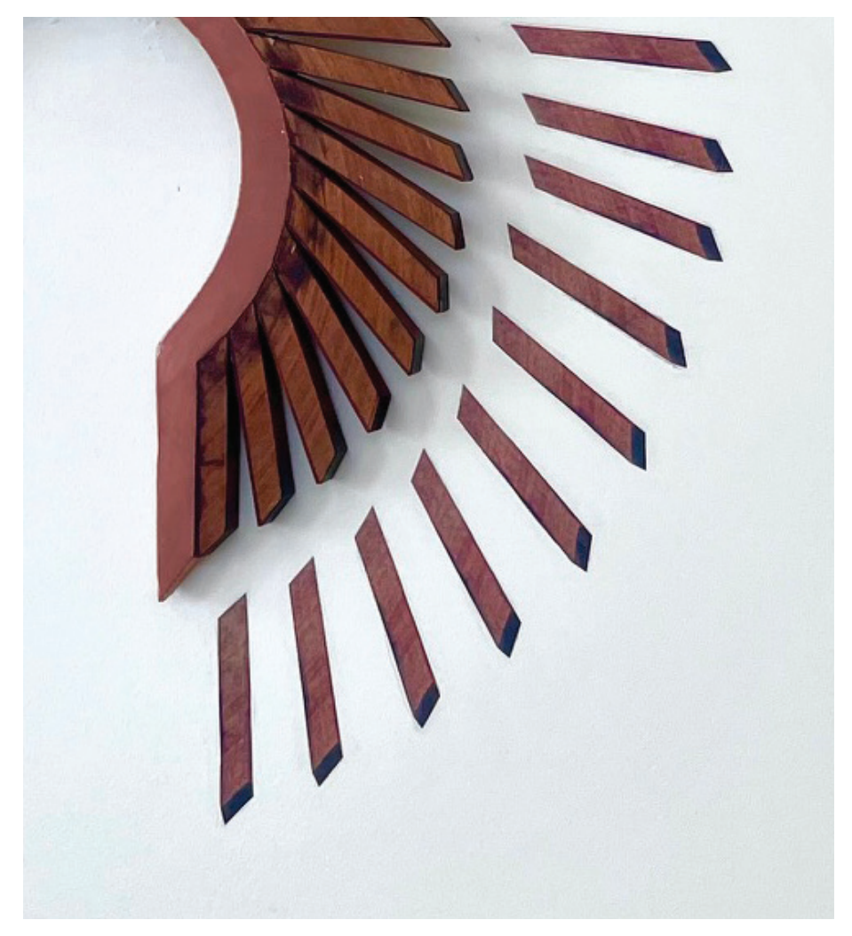
Above Image: Autumn T. Thomas, Chi Wara headdress (detail), 2023, wood and oiled paper.