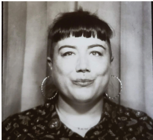
Cover Image and headshot: images courtesy of the artist.

Use old magazines, newspapers, or scraps of fabric to make a collage in the space below!